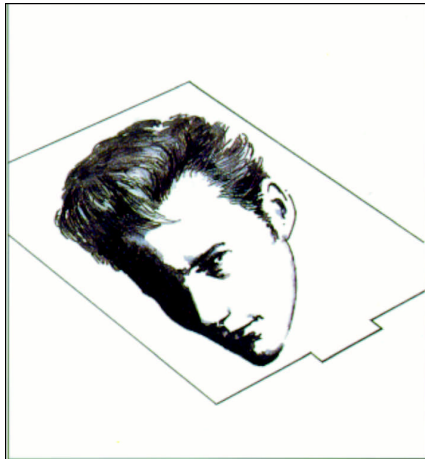
Photo labels are easy to make and can be put on bags or clothes.

Cut out the photocopy of your photograph, leaving a little 'tag' at one end, so you don't get Image Maker all over your hands.